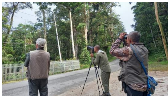
Figure 9. Bird watching activities in surrounding Tambing Lake, LLNP

Tambing Lake is the main tourist attraction in LLNP and administratively is