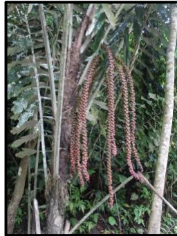
Figure 3. Take