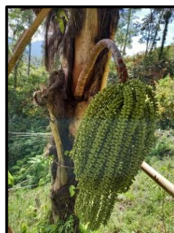
Figure 6. Aren