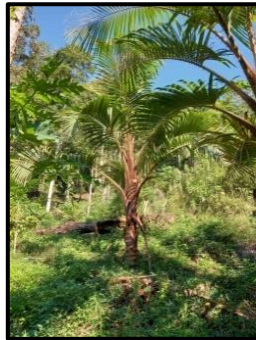
Figure 4. Wanga