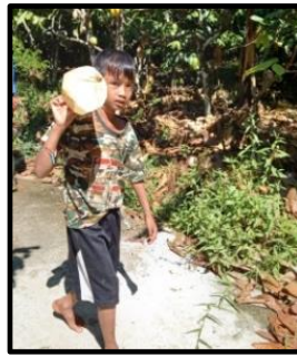
Figure 7. Sugar palm umbut