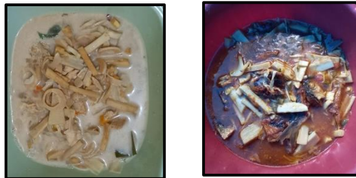
Figure 8. Processed food from areca and rattan umbut called sayur umbut

One of the local cuisines in the buffer zone of LLNP used as a gastronomic attraction is the umbut based foods. They are served in various important events such as weddings, customary events, and mourning events, as well as for daily needs. The delicious taste makes these foods worthy to be served as part of the tourist attractions for supporting tourism attraction of Taming Lake. Besides its uniqueness, it benefits for nutrition for instance rattan umbut contains various substances that are good for the human body. Referring to the nutritional content, rattan's umbut can be used as a good food to energy booster. According to TKPI (2019), rattan's umbut has a composition per 100 grams of water (87.6 g), Calcium (184 mg) Phosphorus (135 mg), Sodium (256 mg), and Potassium (81 mg).