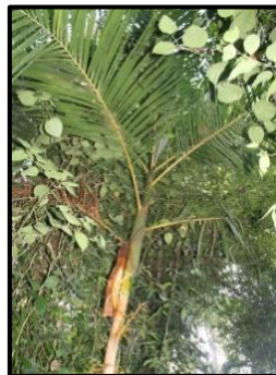
Figure 5. Sarao