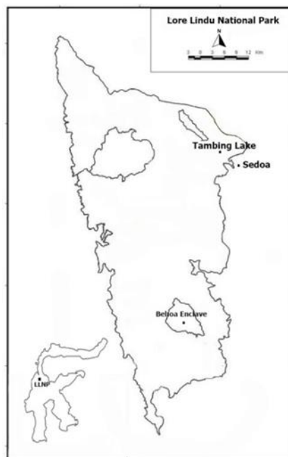
Figure 1. Site of research

The field survey was carried out exploratively to find out the plants of NTFPs that were used for their roots and also to check the information obtained from the desk study. The secondary data collected included how to harvest and select umbut, cooking methods, serving umbut and data related to tourist visitors and tourism attraction in Lake Tambing.